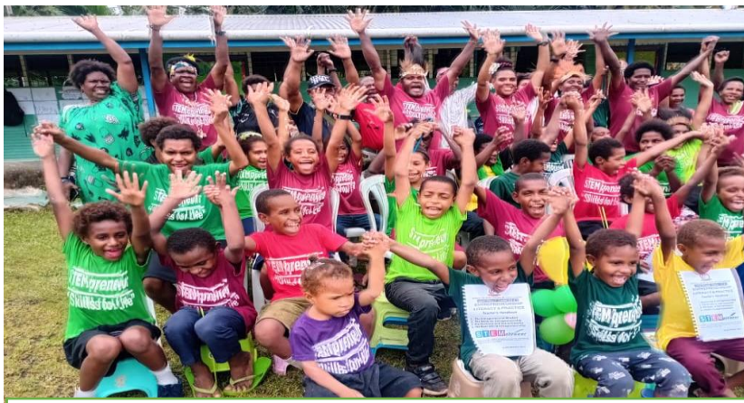
Parents, Teachers and students celebrating the groundbreaking launch of the innovative curriculum.