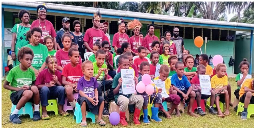
Parents, Teachers and students after launching of the curriculum.

The Cross Country School of Excellence, established in Kiunga in Western Province in 2015, is a forward-thinking educational institution dedicated to providing quality education that bridges the gap between theoretical knowledge and practical skills. The school's innovative approach to education has earned it recognition as a leader in STEM and entrepreneurship education in Papua New Guinea.